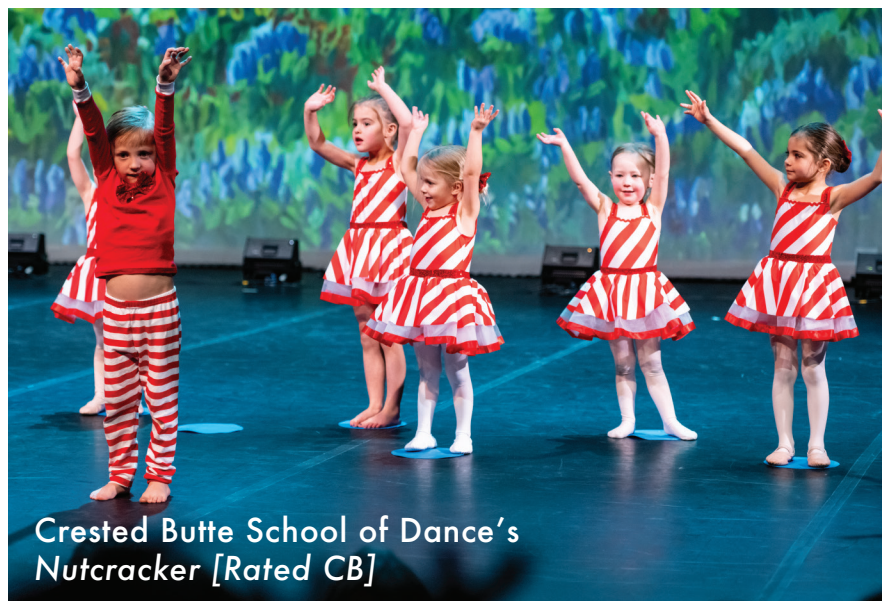
Crested Butte School of Dance's Nutcracker [Rated CB]