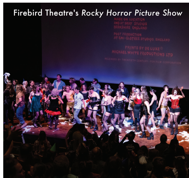
Firebird Theatre's Rocky Horror Picture Show

MADE ON LOCATION AND AT BRAY STUDIOS BERKSHIRE, ENGLAND POST PRODUCTION AT EMI-ELSTREE STUDIOS, ENGLAND PRINTS BY DE LUXE MICHAEL WHITE PRODUCTIONS LTD RELEASED BY TWENTIETH CENTURY FOX FILM CORPORATION