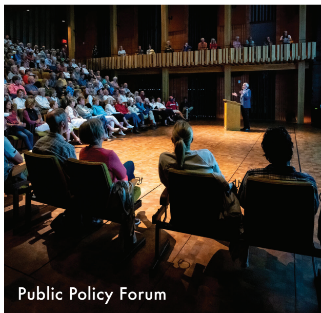
Public Policy Forum