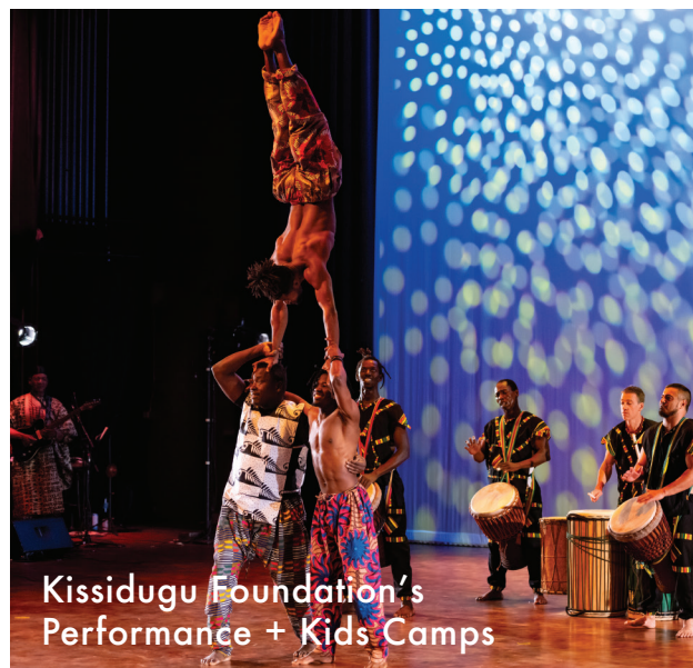
Kissidugu Foundation's Performance + Kids Camps