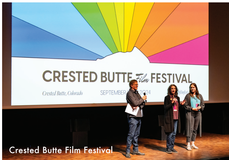
Crested Butte Film Festival