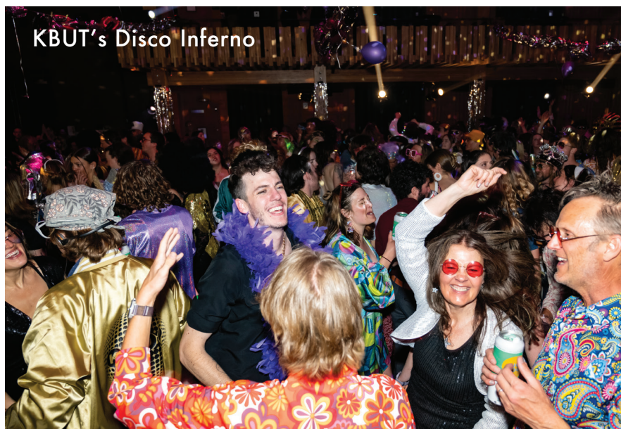
KBUT's Disco Inferno